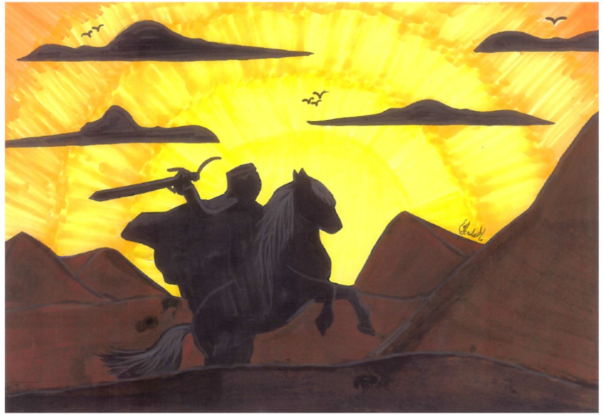
The Song of the Warrior: By Fatma Eisa I A Al-Mohannadi

and over 100 students. The student volunteers participated in faculty-led workshops on oral storytelling collection and narrative writing.